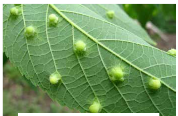
hackberry psyllids (nymph shown below) cause small galls on the undersides of leaves