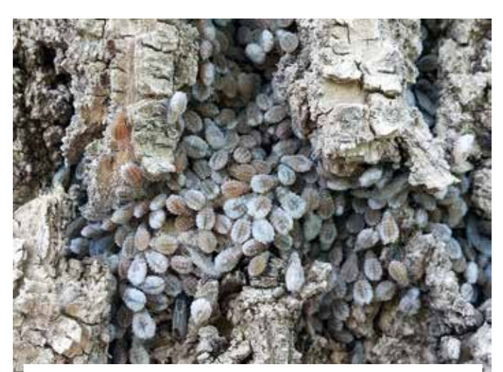
aphids congregating on trunk of ash (top) feeding on foliage causes tightly curled leaves (bottom)

In 2013, there were many reports in Salt Lake, Utah, and Tooele counties of ash trees crawling with cottony aphids on the trunk, branches, and foliage. This aphid ( Prociphilus fraxinifolii ) has a few common names: ash leaf-curl aphid, leafcurl ash aphid, or woolly ash aphid.