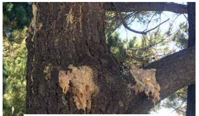
pitch moth feeding sites form masses of pitch (top); remove the pitch and often a larva will be exposed (bottom)

· treat trunks of pines in the next few weeks