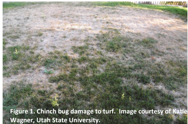
Figure 1. Chinch bug damage to turf.

Typical damage is patchy dieback that forms larger patches and in severe cases, complete lawn loss (Fig. 1). Chinch bugs kill turf through mechanical damage to grass stems and by injecting saliva during feeding (piercing and sucking), which inhibits the transport of water within the plant. Feeding damage can often mimic drought stress; however, chinch bug damage will not respond to increased watering as a drought-affected lawn would. Feeding damage is often worse on plants that are already affected by drought.