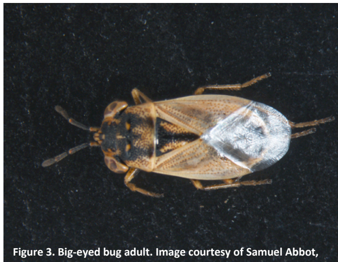
Figure 3. Big-eyed bug adult.

In Utah, chinch bugs seldom need insecticidal treatment unless the population has exceeded threshold levels and damage is evident. Effective insecticides include bifenthrin and other pyrethroids. For best results apply an insecticide in the spring during adult emergence from overwintering sites. Killing emerging bugs will limit the number of eggs laid in the first generation and help reduce the population size throughout the summer.