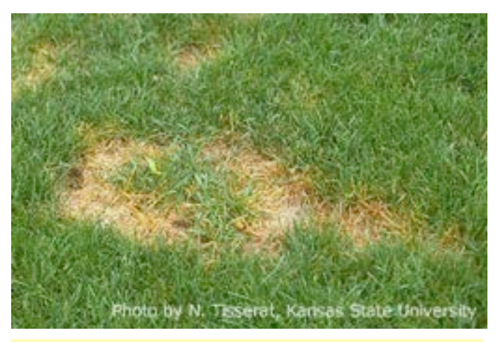
Summer Patch (Magnaporthe poae)

Favorable Conditions: moderately warm air temperatures (60-70°F) and high soil pH. Excessive N fertilization in the spring.