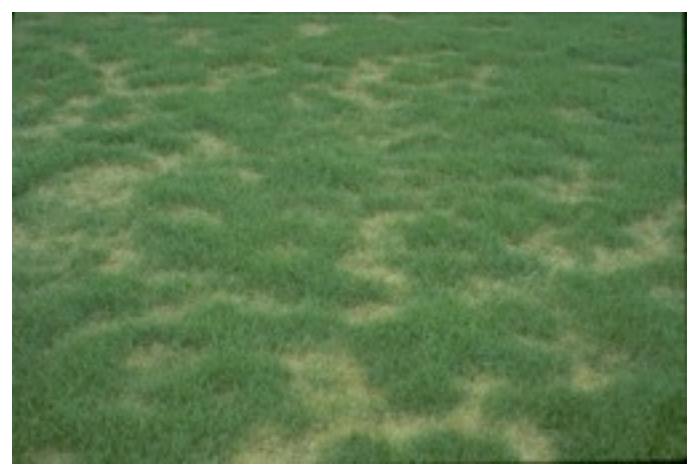
Necrotic Ring Spot (Ophiosphaerella korrae)

Azoxystrobin (Heritage), myclobutanil (Eagle), propiconazole (Banner MAXX, Propiconazole Pro), and azoxystrobin + propiconazole (Headway).