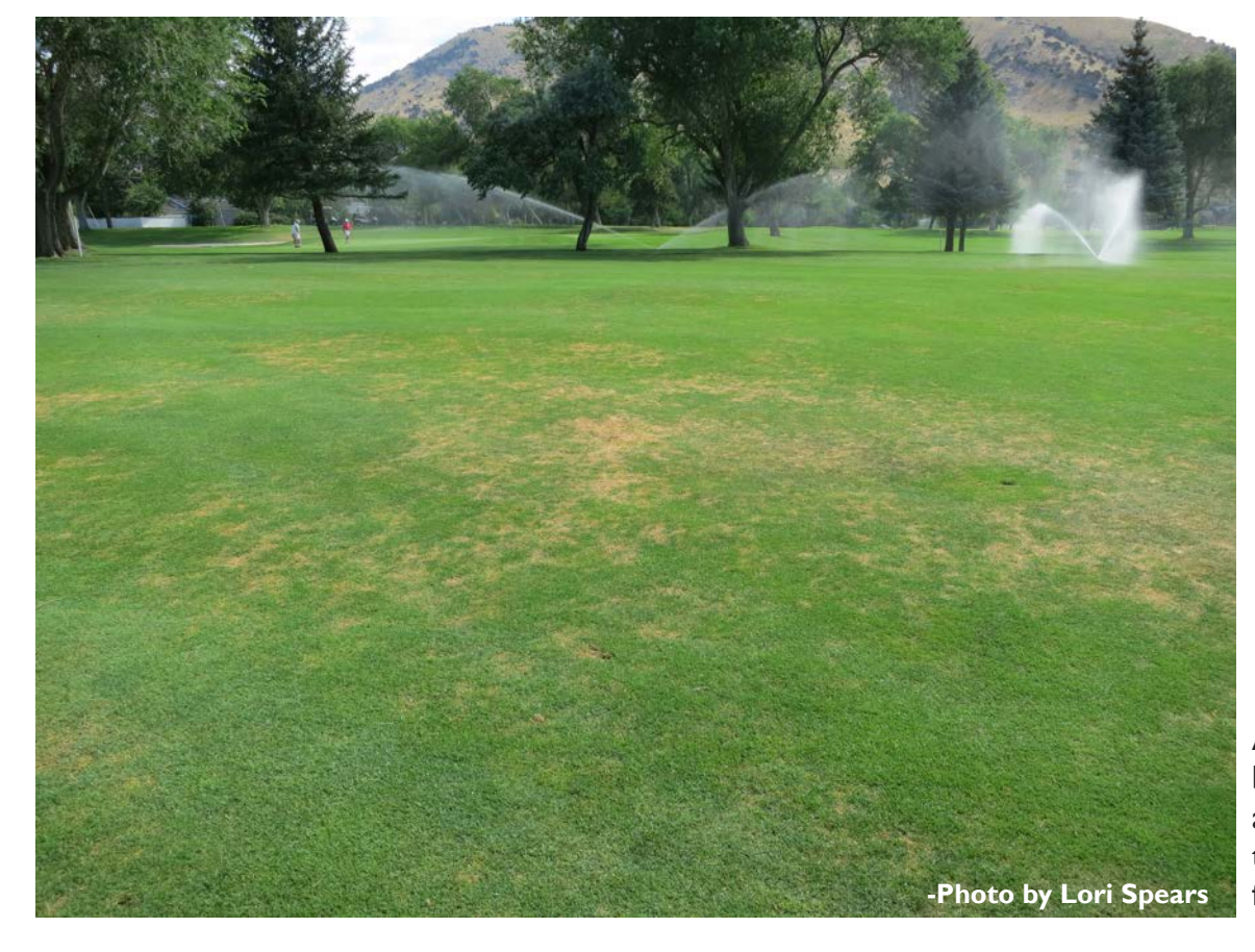
Areas affected by billbug larvae appear as patches of dead turf and pull easily from the soil.

Billbugs ( Sphenophorus spp.) are common pests of turfgrass and they are still active this summer. Three common billbug species are found in Utah, including the bluegrass billbug, the Denver (or Rocky Mountain) billbug, and the hunting billbug. Recent monitoring efforts in Cache County have identified all three of these species, with bluegrass and hunting billbug being the most abundant. Trap collection in the area showed that adult activity began in early May and peaked in late June. Eggs were also found in early June and larvae were apparent by mid-June. In one location, upwards of 20 billbug larvae per square foot were found. Unfortunately, sampling for billbug larvae has revealed that young and older stage larvae are still present at this time.