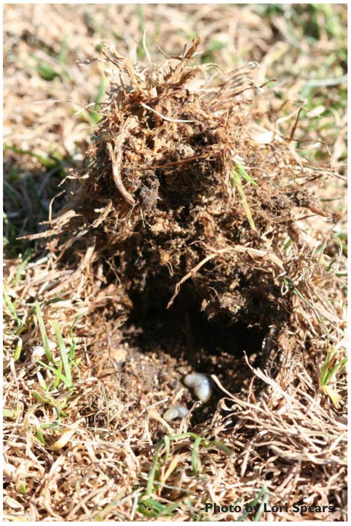
Gently pulling up on damaged turf can reveal billbug larvae in the soil.