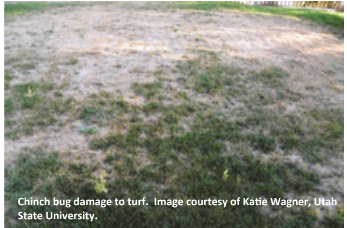
Chinch bug damage to turf.