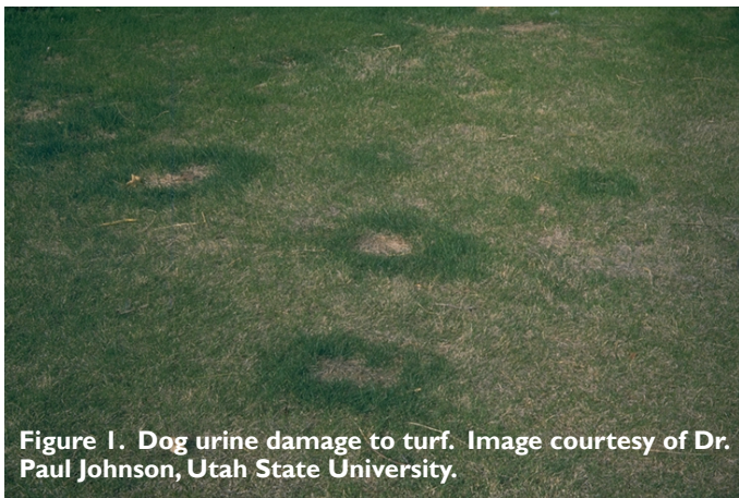
Figure 1. Dog urine damage to turf.

Animal urine can make it difficult for anyone to maintain a uniformly green and healthy lawn. Deer, fox and geese urine can discolor turf, but for homeowners the problem is usually caused by pet dogs. Patches of dark green and/or brown turf may appear wherever Fido is relieving himself. The exact mechanism of the injury to the grass is not completely understood, however, it is widely believed that the highly concentrated salts in dog urine dehydrate the turf.