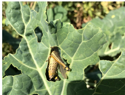
Adult grasshopper feeding on brassica foliage