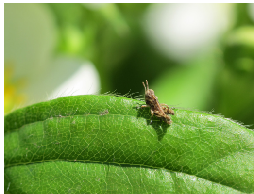
Early instar grasshopper nymph

Grasshoppers have chewing mouthparts that tear away plant tissue. Grasshopper injury is most often associated with rangeland, corn, small grains, and vegetable crops. However, during heavy infestations almost any type of plant may be attacked, including trees, shrubs, ornamentals, flowers, and turfgrass. Grasshoppers are commonly thought of as foliage feeders, but will also feed on flowers, fruits, seed heads, stems, and essentially all above ground plant parts. Often fence rows and roadsides adjacent to crops serve as the major sources of grasshoppers; as the vegetation dries up in such areas, grasshoppers that hatched and matured there move into adjacent crops.